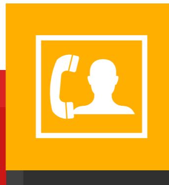
8 SIP Account