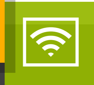
2.4 GHz Wifi & AP